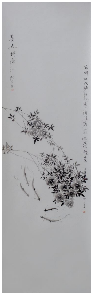
5612(1) Xi (Joy) 95x315cm