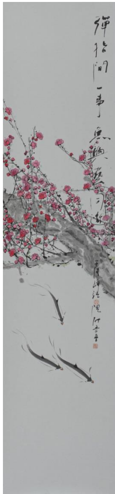
5628(1) Tan Zi (The moment) 52x226cm